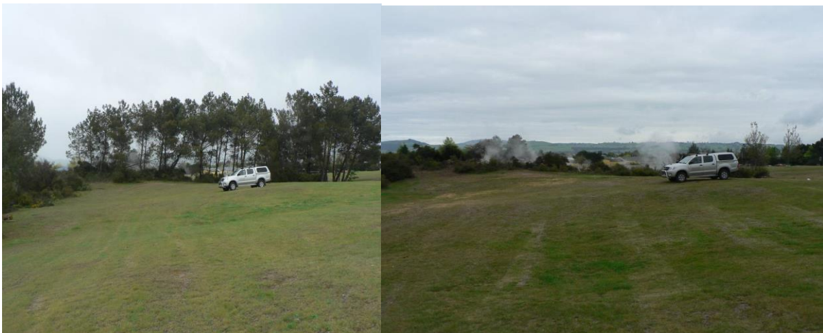
Before and after photos of removal of wilding pine trees and other weeds

A project to restore the vegetation around the geothermal feature in Crown Park Taupo has been substantially completed. This involved the removal of the wilding pines, broom, cherries and rubbish from the site as well as re contouring the valley floor. This area is used by local people to steam cook their food. We were treated to a meal cooked this way while working there and it was delicious! Kevin Loe Plant Pest Contractor (EW Taupo)